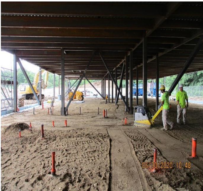
COMPACTION OF BUILDING B SUBGRADE