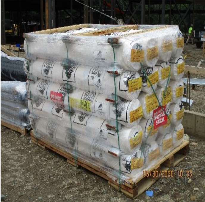
BUNDLES OF STEGO SLAB VAPOR BARRIER FILM