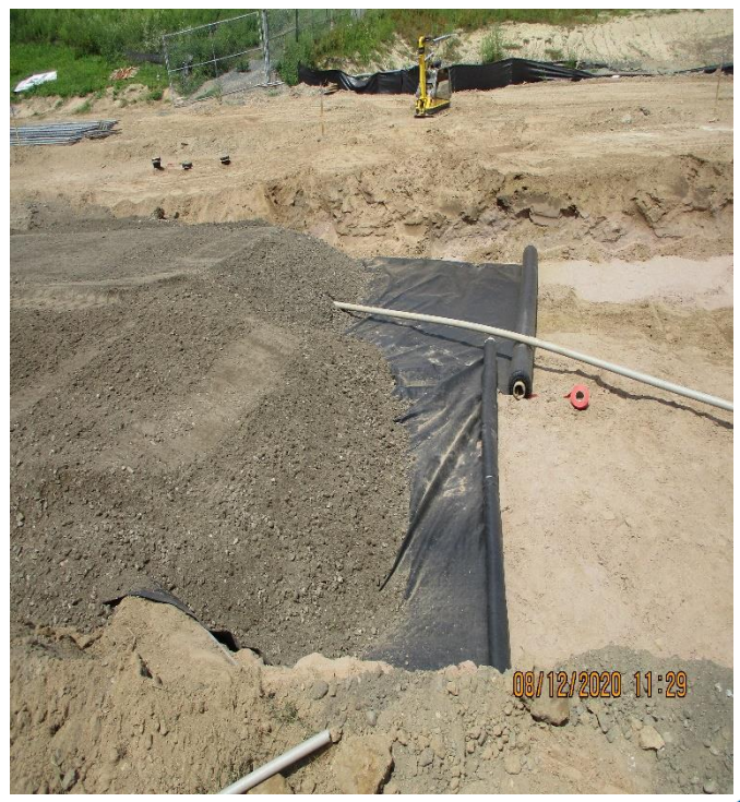
STABILIZATION FABRIC AT BASE OF ACCESS ROAD