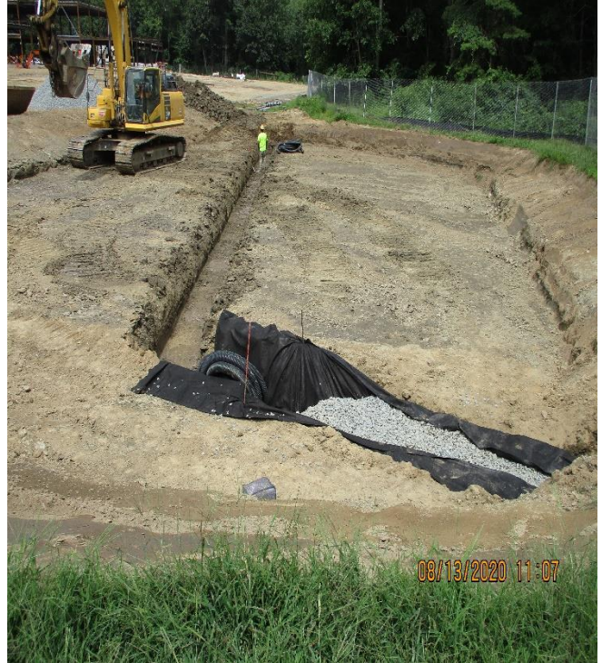
BIORETENTION BASIN #1