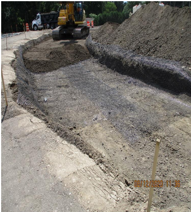
GEO-GRID BEING INSTALLED AT ROUNDABOUT