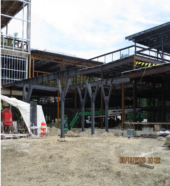
FRONT ENTRANCE CANOPY STEEL