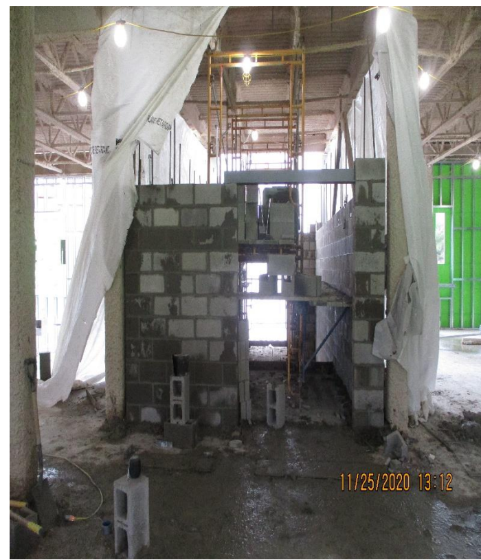
STAIR WELL E2 WALLS ABOVE SECOND FLOOR