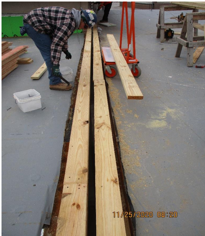
ROOF EXPANSION JOINT BLOCKING