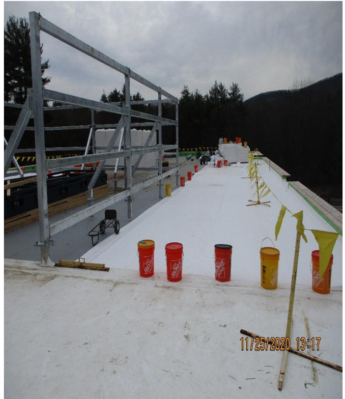
PARTIAL ROOF ON BUILDING D