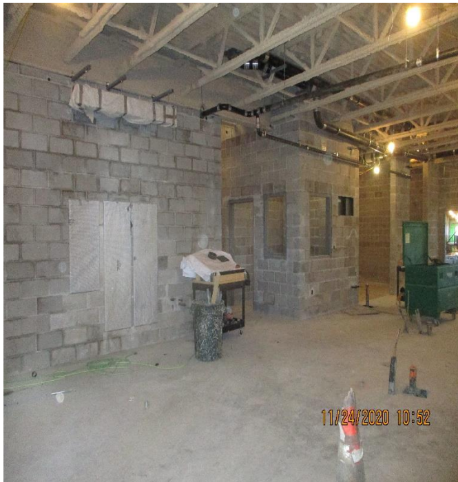
BLOCK WORK IN KITCHEN AREA