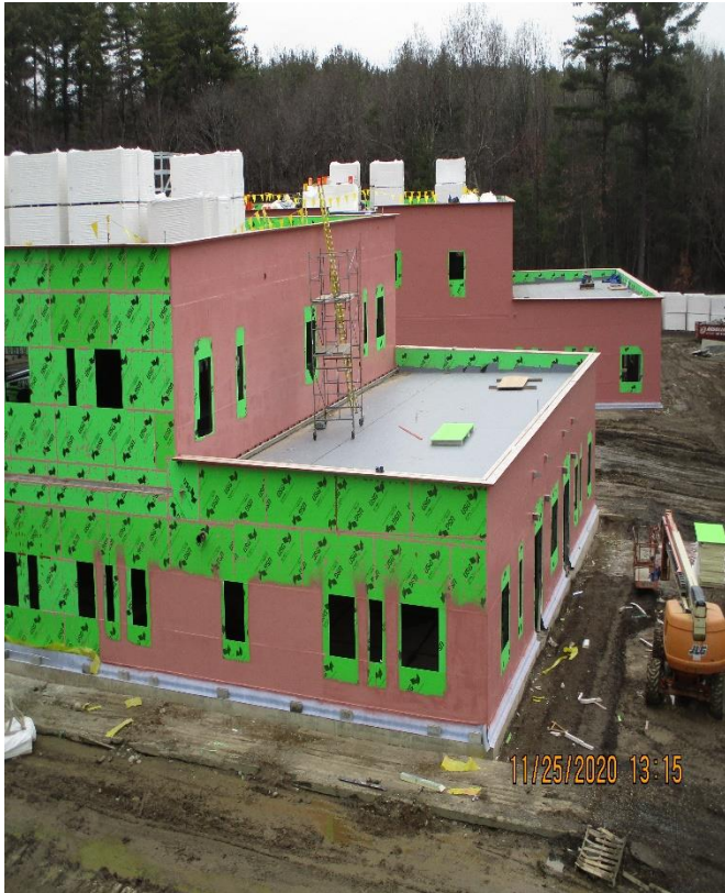
VAPOR BARRIER ON BUILDINGS D & E