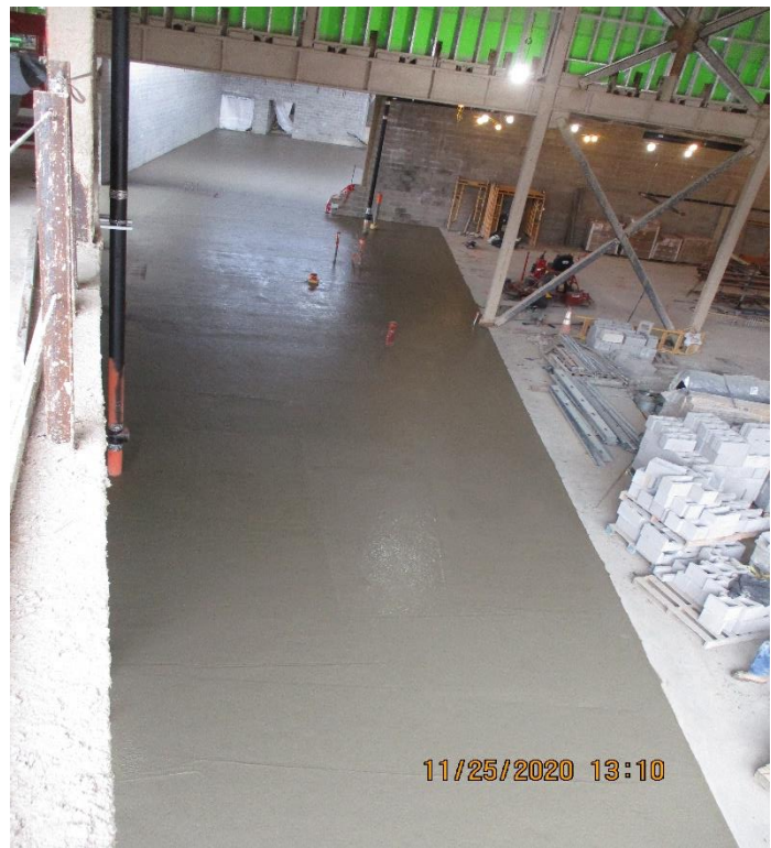
EAST END OF ELEMENTARY SCHOOL CAFETERIA