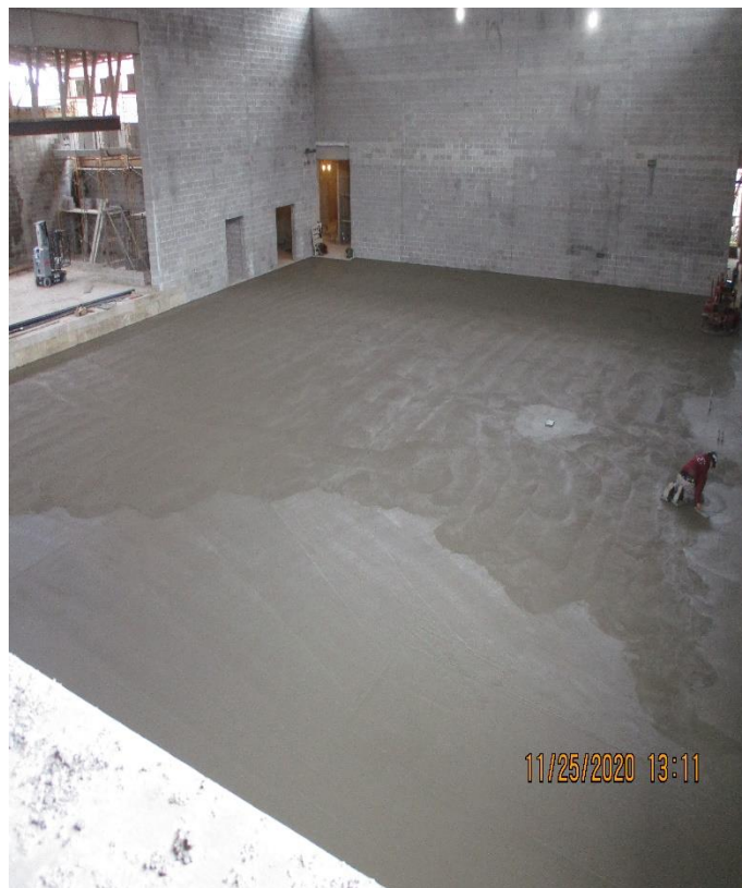
GYM SLAB BEING FINISHED