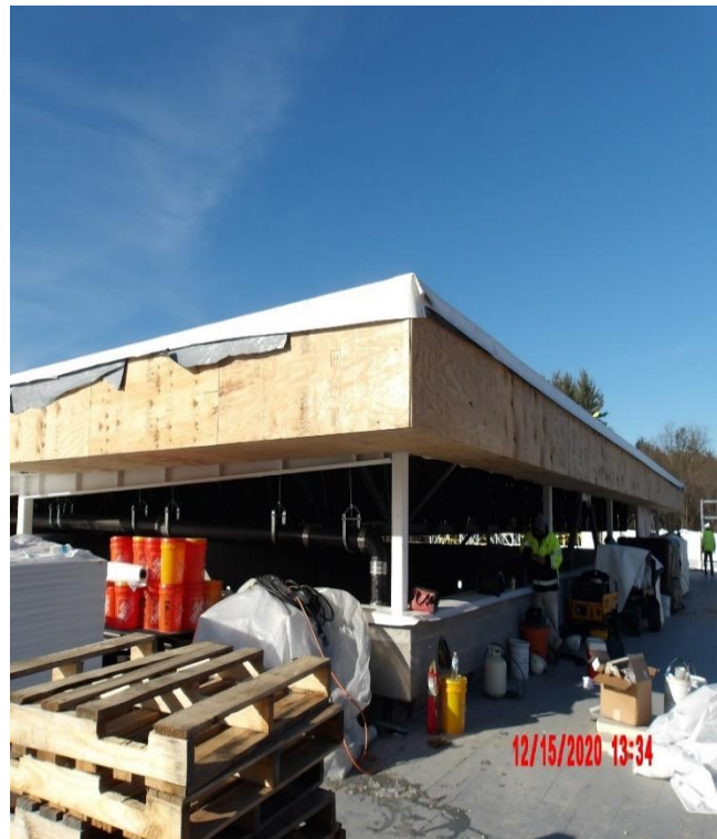
WOOD BLOCKING FOR GYM ROOF FASCIA