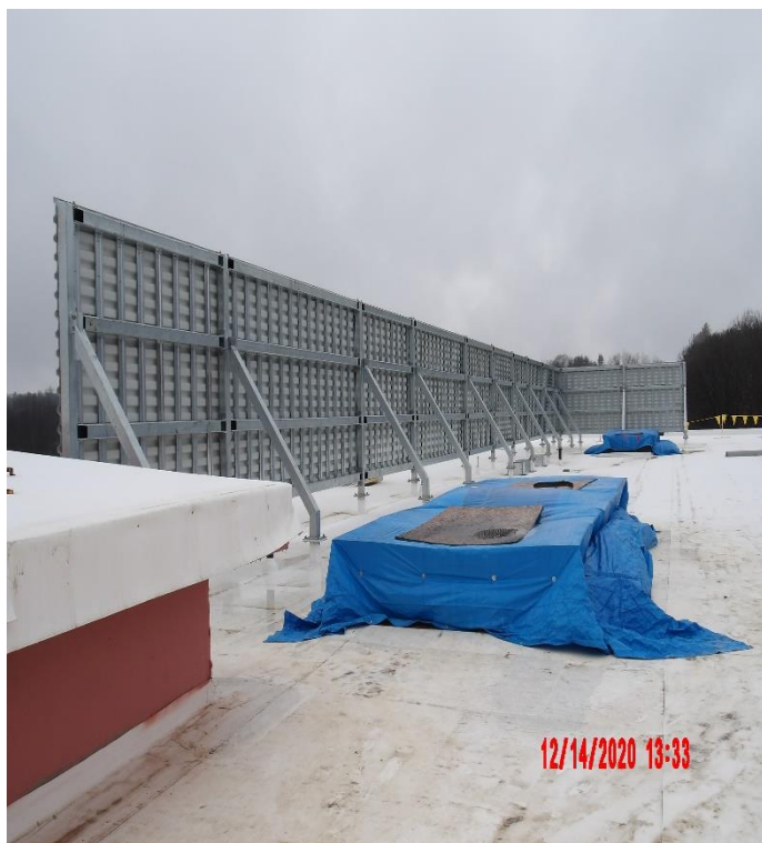
REAR VIEW OF ROOFTOP MECHANICAL SCREEN