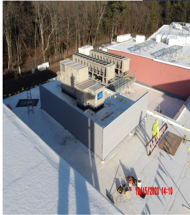
MECHANICAL SCREEN OVER THE MS CAFE