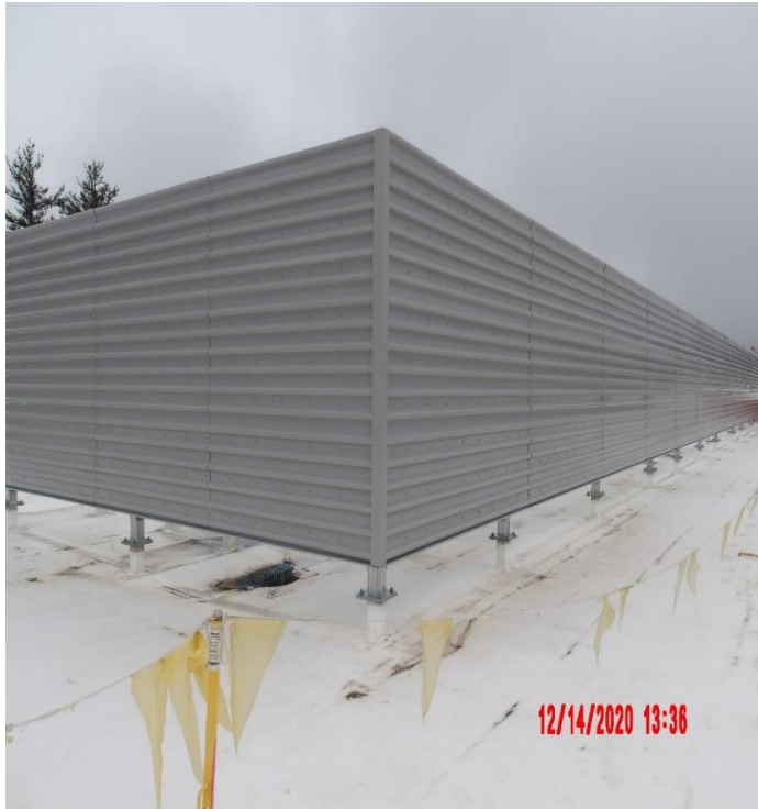
FRONT VIEW OF ROOF TOP MECHANICAL SCREEN