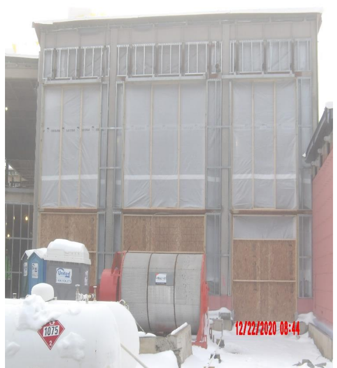
BUILDING C BUTTONED-UP FOR WINTER