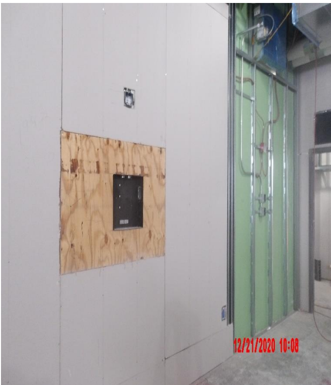
TYPICAL BLOCKING AND BACKBOX FOR TV