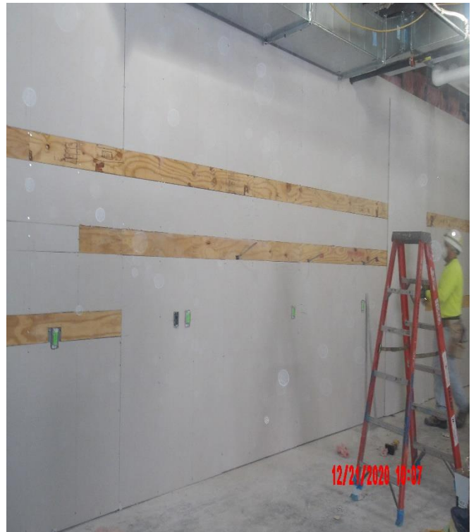
TYPICAL CLASSROOM IN-WALL BLOCKING