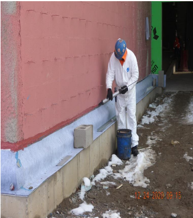
SEALING TERMINATION BAR OF FLASHING