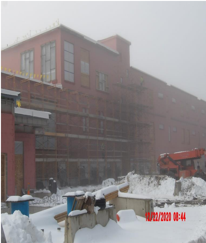
NORTH-EAST CORNER OF B READY FOR BRICK