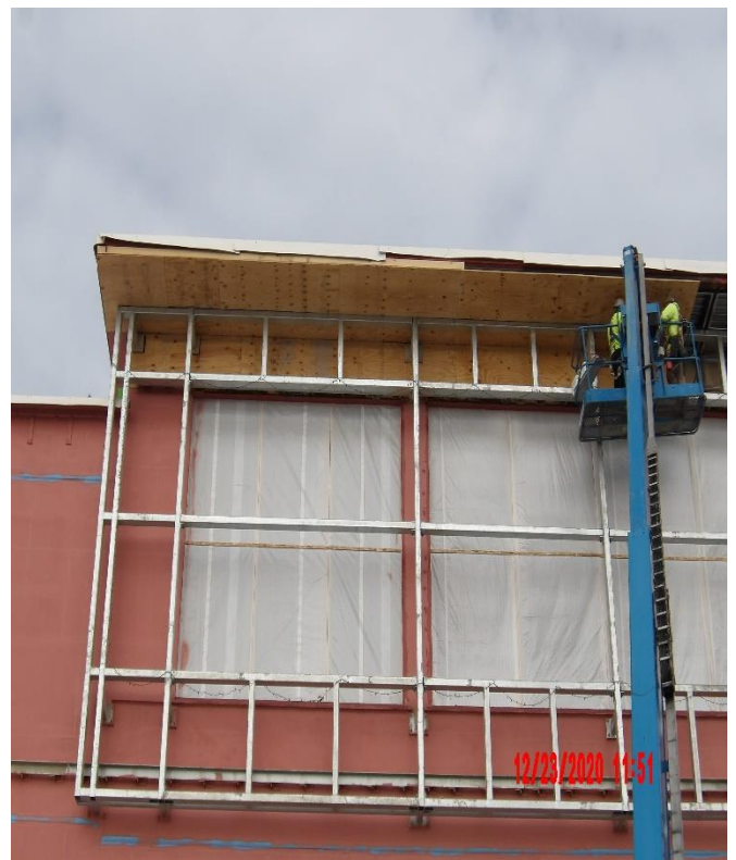
PLYWOOD SHEATHING OF SOFFIT & FASCIA AT MEDIA CENTER OVERHANG