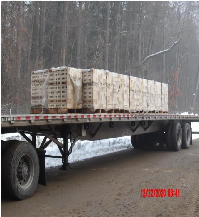
BRICK FINALLY ARRIVES