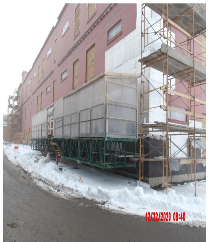
HYDRO SCAFFOLDING ENCLOSED FOR WINTER