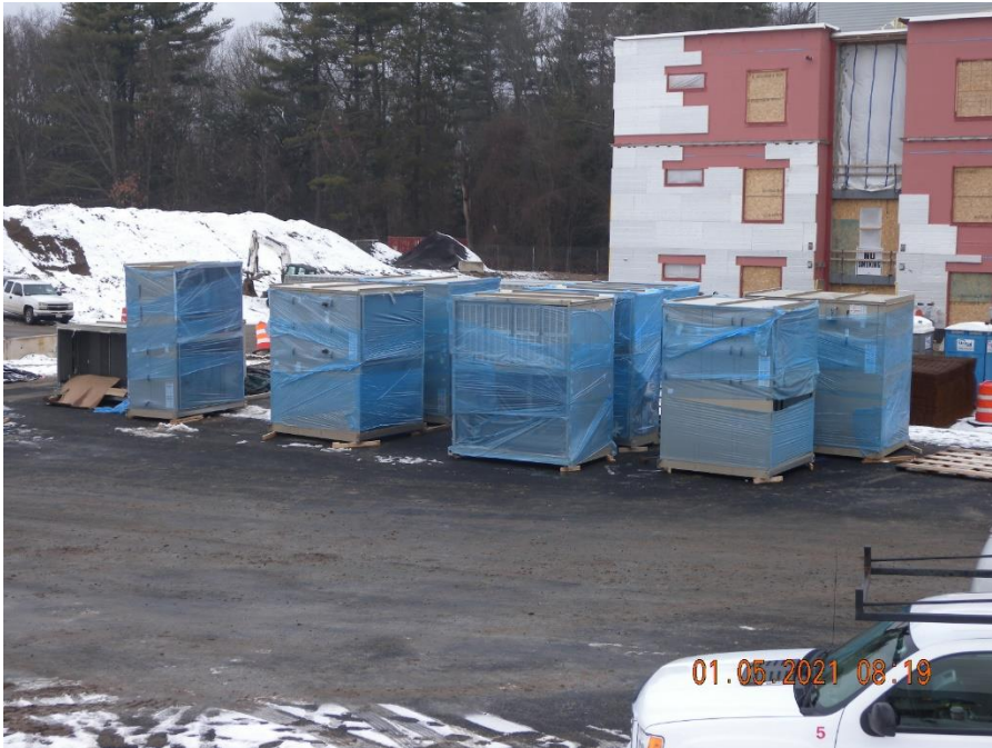
More RTU's Delivered.