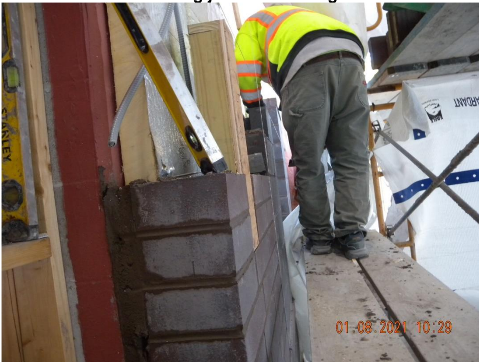
Brick work at North face of building B.