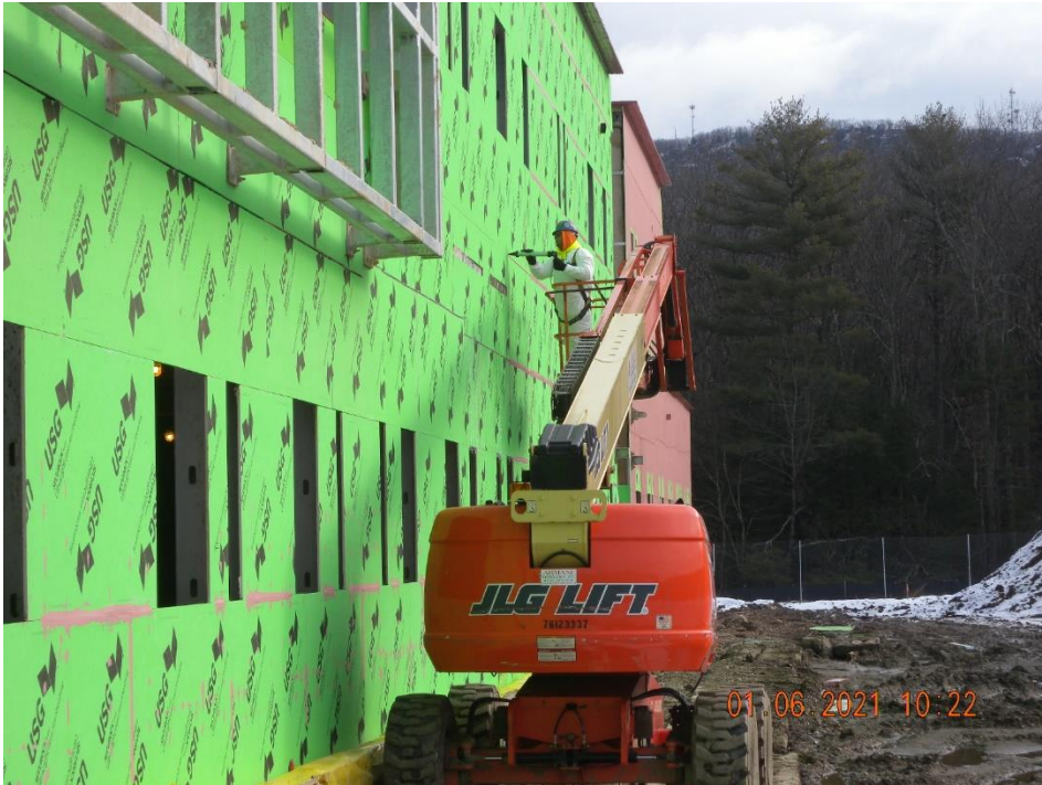
Sealed Exterior Sheathing joints at building F.