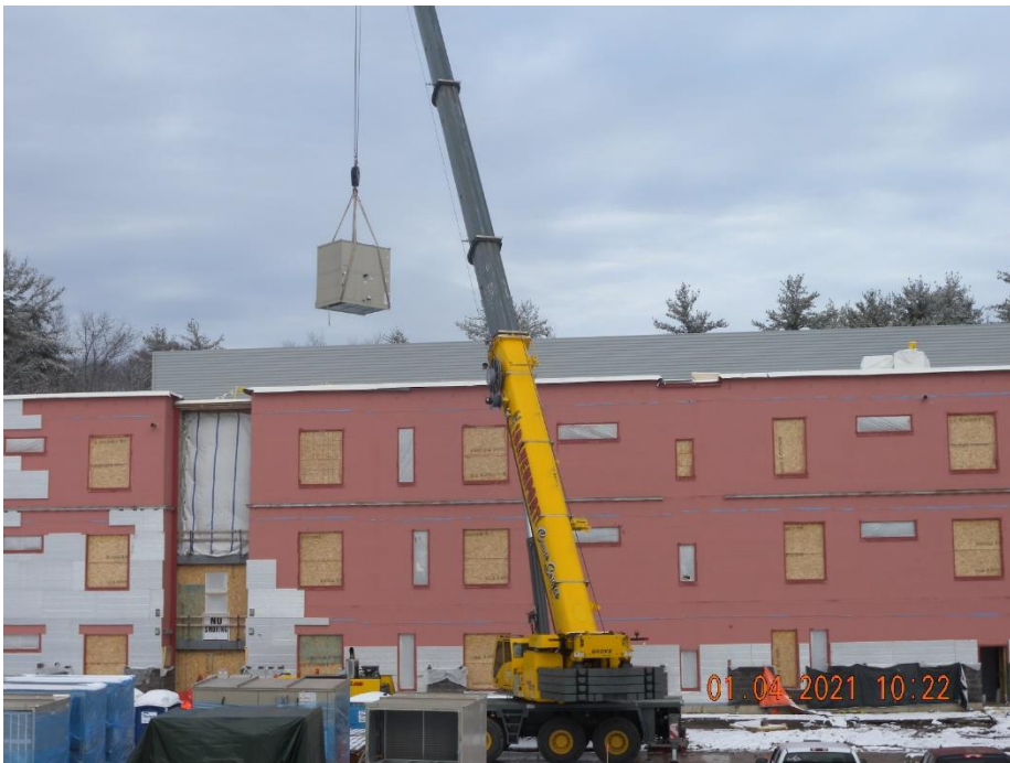
RTU'S Erected at B building.