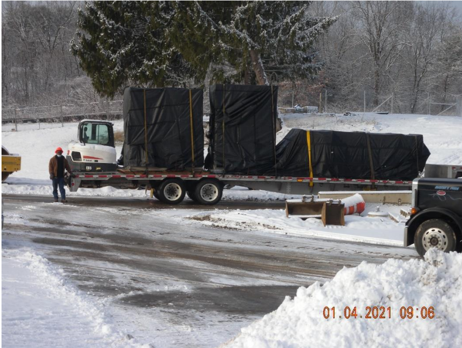
RTU's Delivered on site.