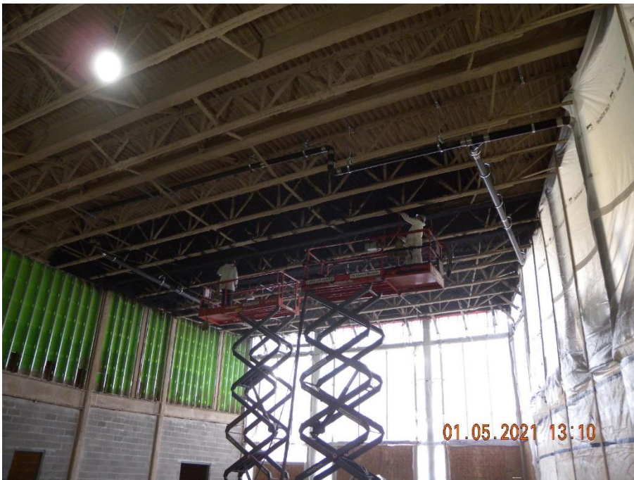
Spraying soundproofing in cafeteria.